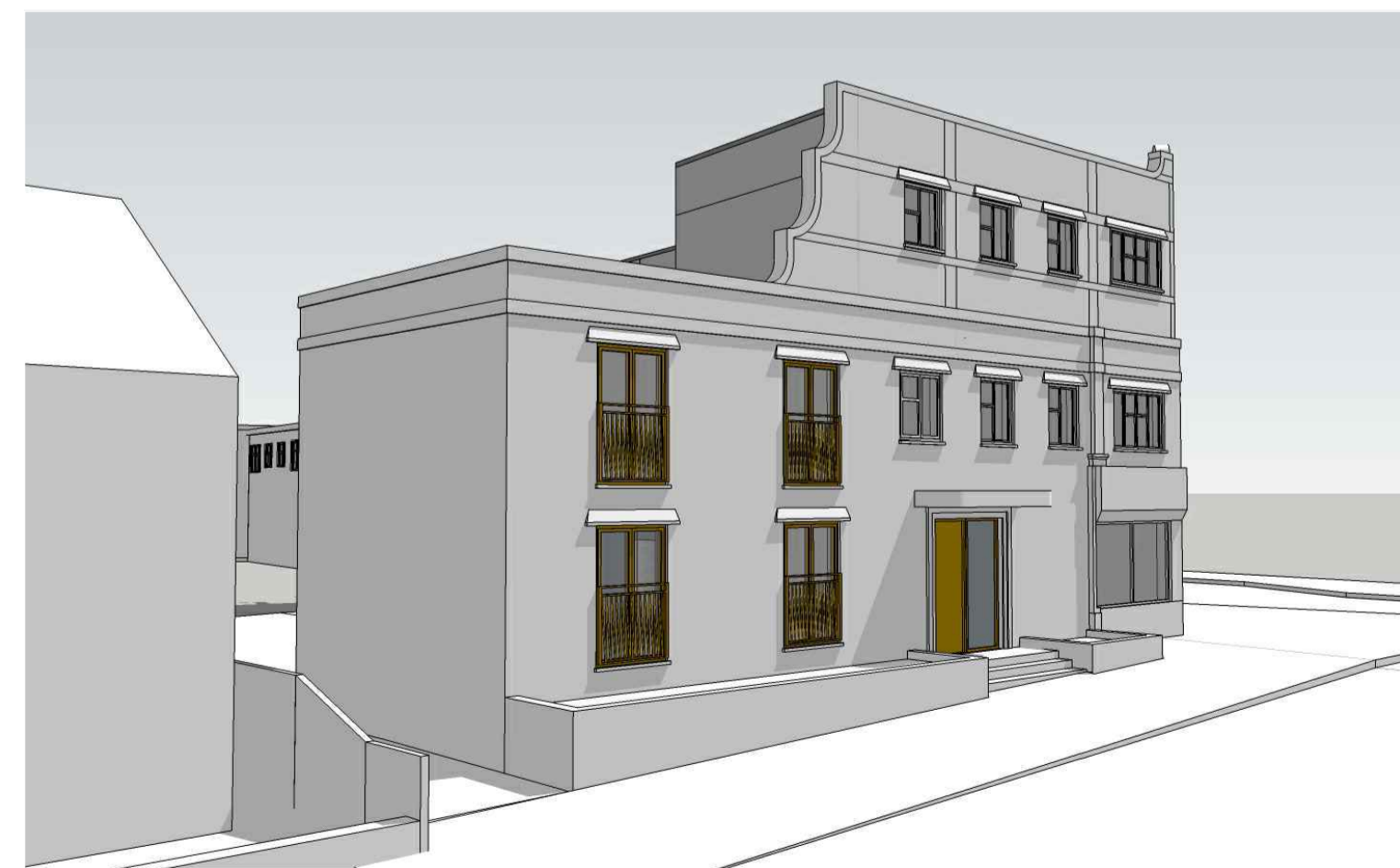
Grasmead Avenue (West) Elevation