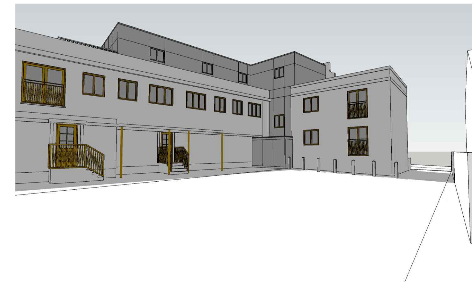
Parking Area (North) Elevation