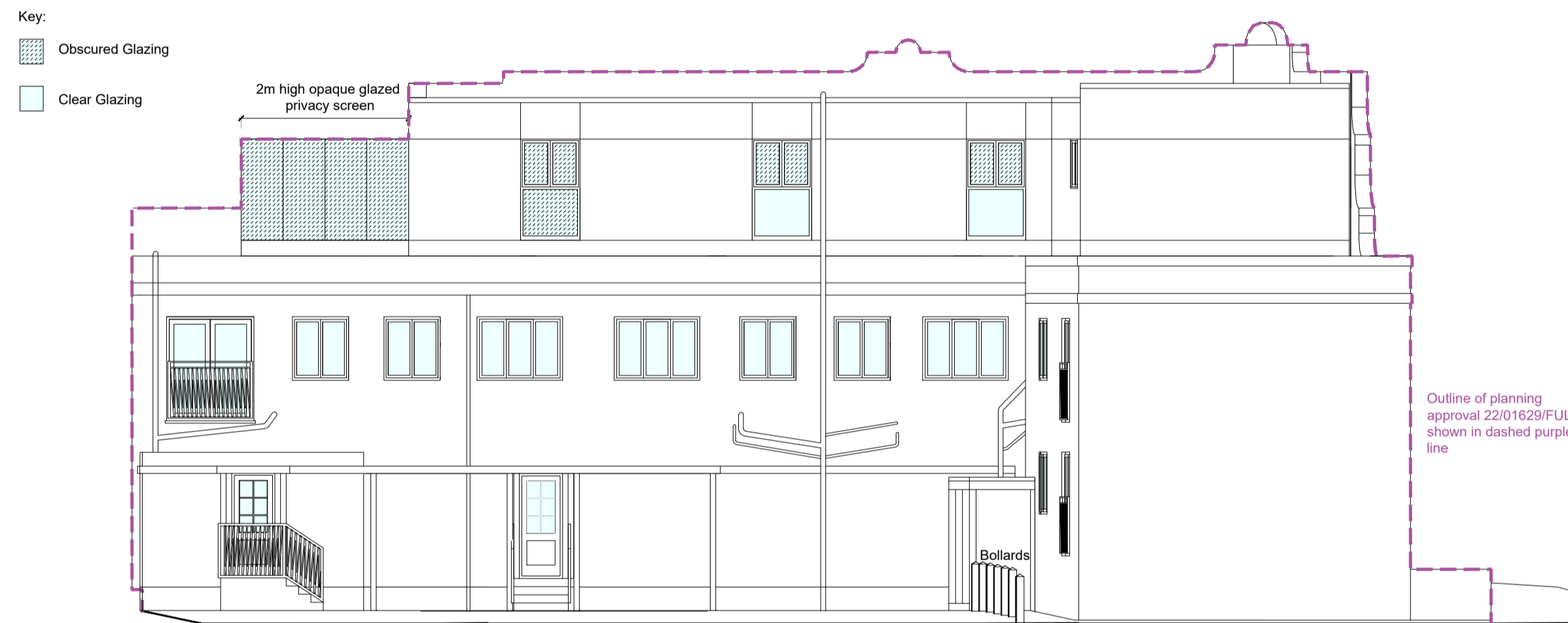
Proposed North Facing Elevation 1:100