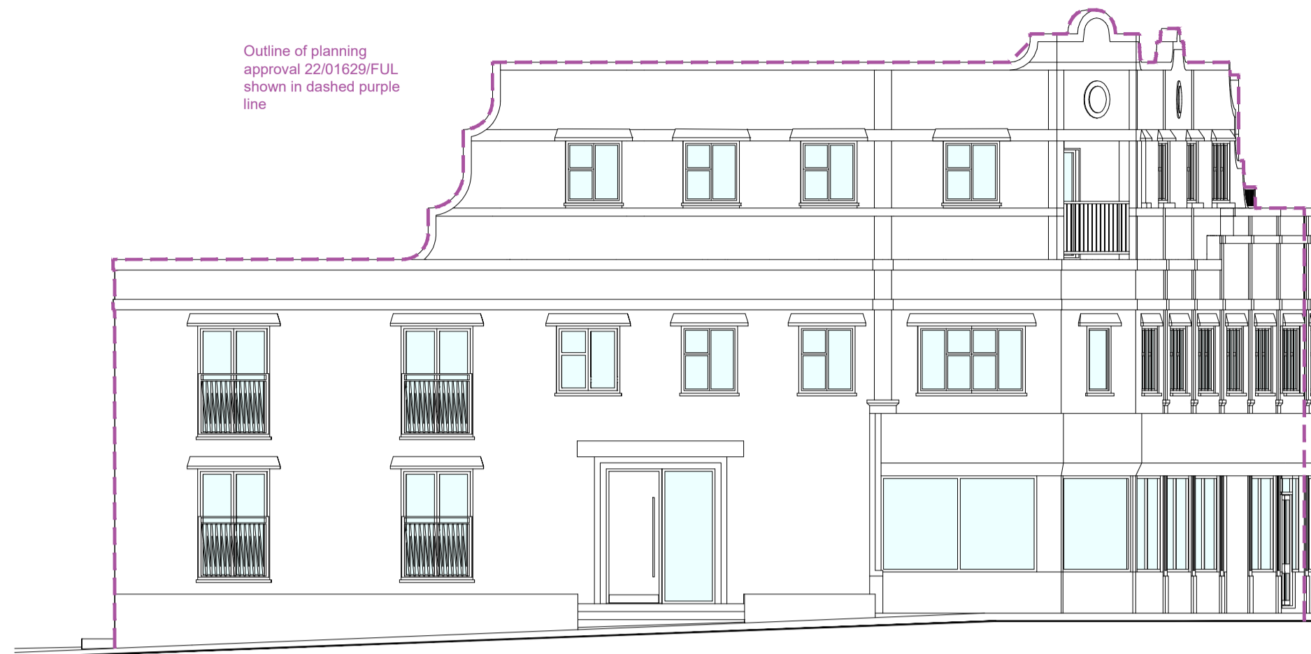
Proposed West Facing Elevation 1:100