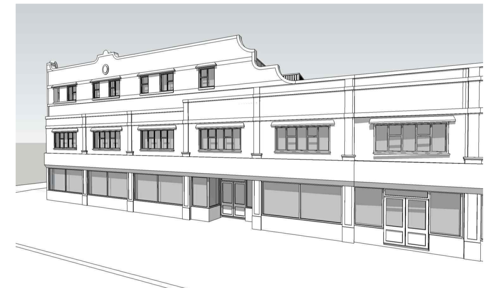
London Road (South) Elevation