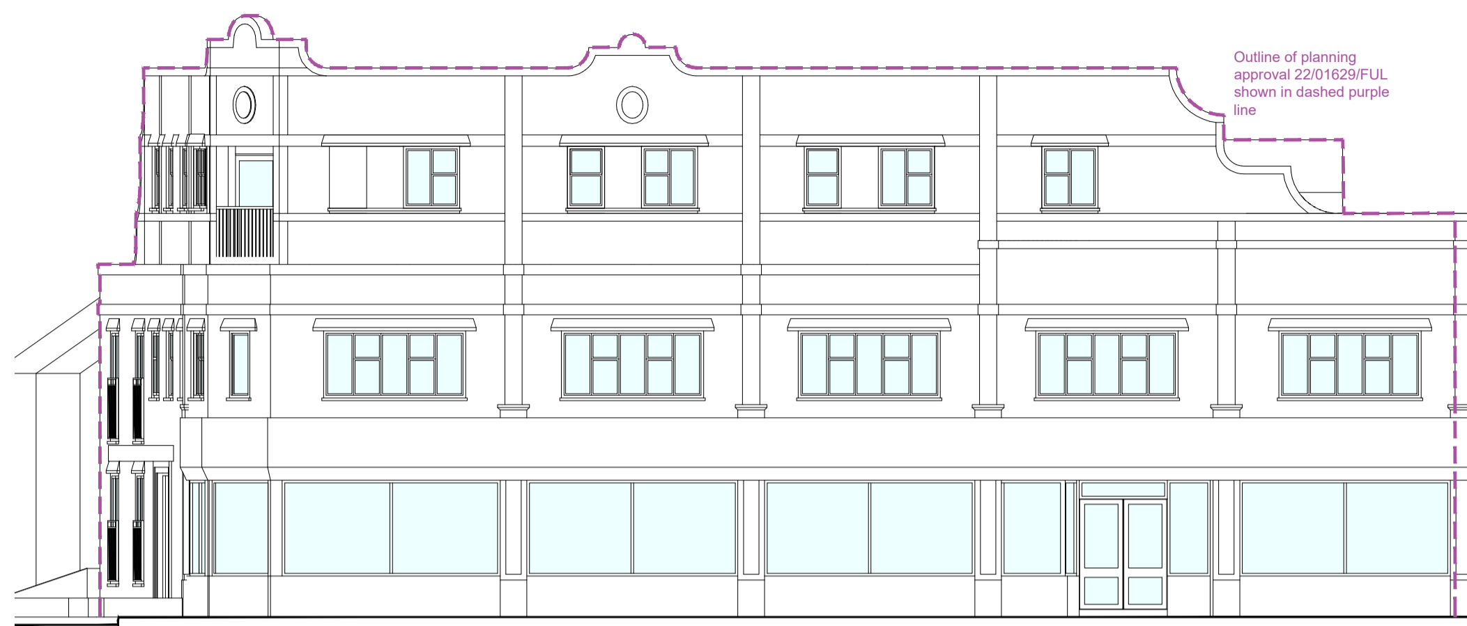
Proposed South Facing Elevation 1:100