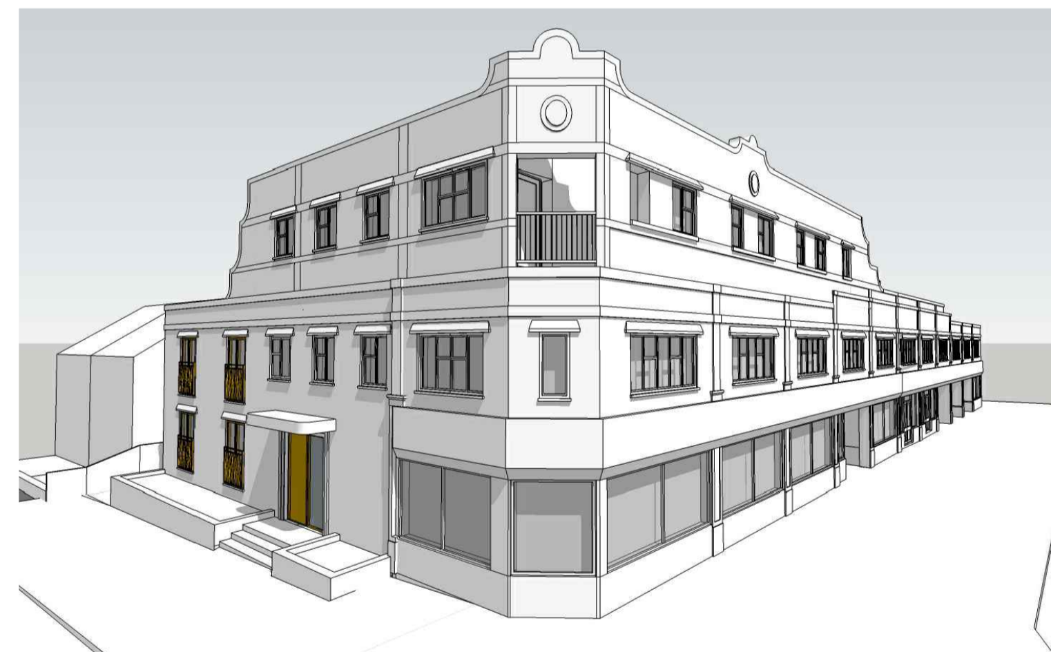
Grasmead Avenue & London Road (West & South) Elevations